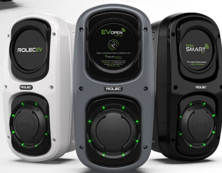
WALLPOD:EV Socket (Type 2) Charging Unit

Compatible with all EVs/PHEVs, the WALLPOD:EV is available in Mode 3 fast charging in both 3.6kW and 7.2kW, as well as SuperFast 11kW and 22kW speeds.